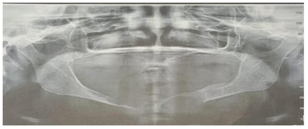
Figure 2: Panoramic radiographs revealed multiple radiolucent areas in the symphyseal region.