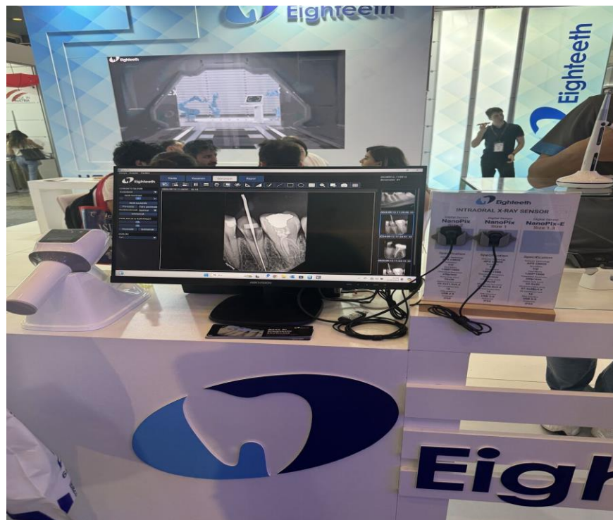
Figure 5: Eighteenth brand x-ray.